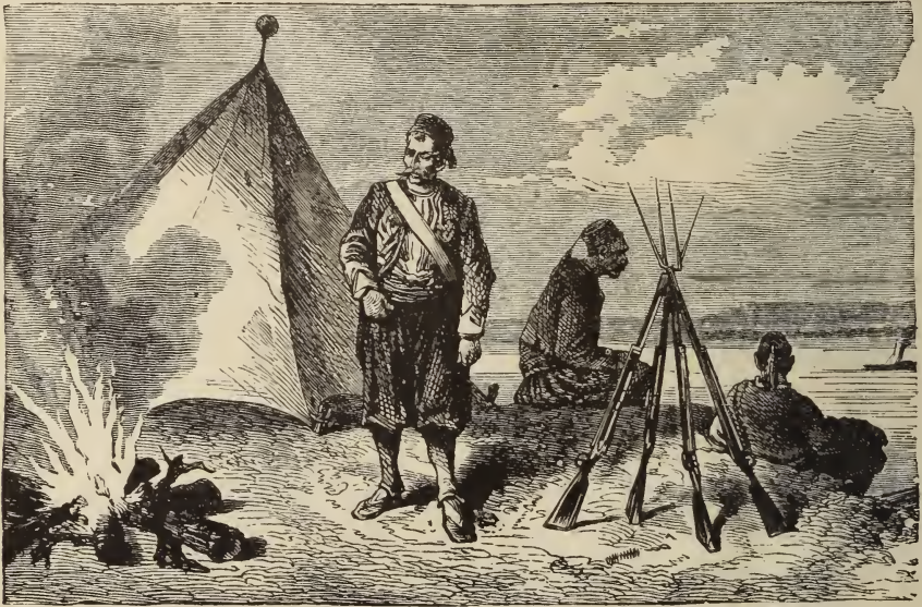
TURKISH OUTPOST ON THE DANUBE.

The Bulgarian people are not without courage in war, although they have been a subject race for something like five hundred years. Some of their